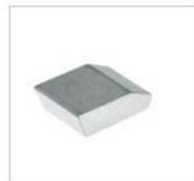
Saw tips -JX